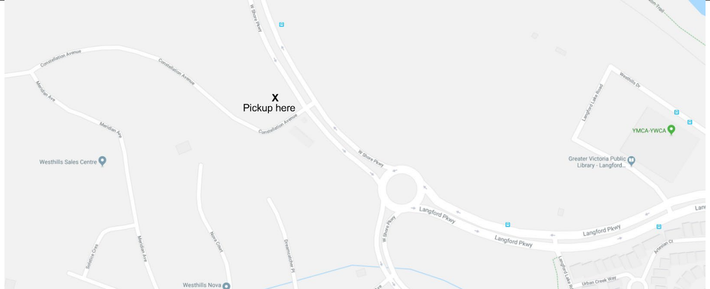
Constellation Avenue Pick-Up